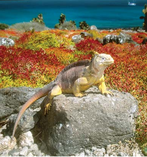
Observe the distinct creatures indigenous to the Galápagos Islands, like this land iguana, the same way Charles Darwin did more than 150 years ago.