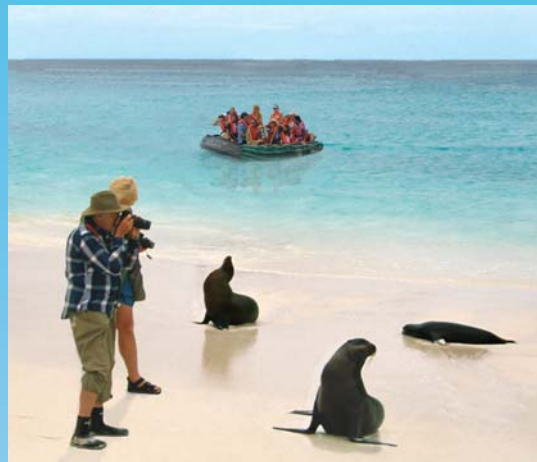
Take photographs of a lifetime during up-close Galápagos wildlife encounters.

Please note that the M.V. SANTA CRUZ's specific itinerary and cruise pattern is dependent on weather, sea conditions and Galápagos National Park Service regulations.