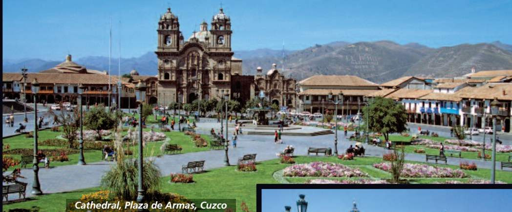
Cathedral, Plaza de Armas, Cuzco

surviving example of Inca town planning.