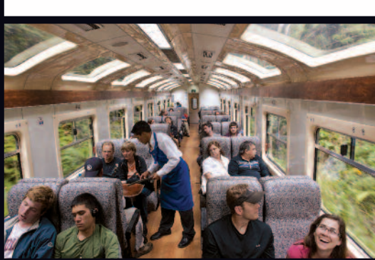
Above: Scenic train ride through the Sacred Valley to Aguas Calientes