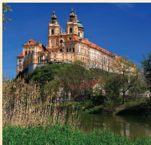
Top: The Middle Rhine Valley, Katz Castle and legendary Loreley | Above: Melk Abbey

houses and a nearly perfect rendering of baroque architectural grandeur. Books as old as 1,200 years are among 100,000 volumes in the library, a quiet testament to the considerable monastic influence on science and culture through the ages.