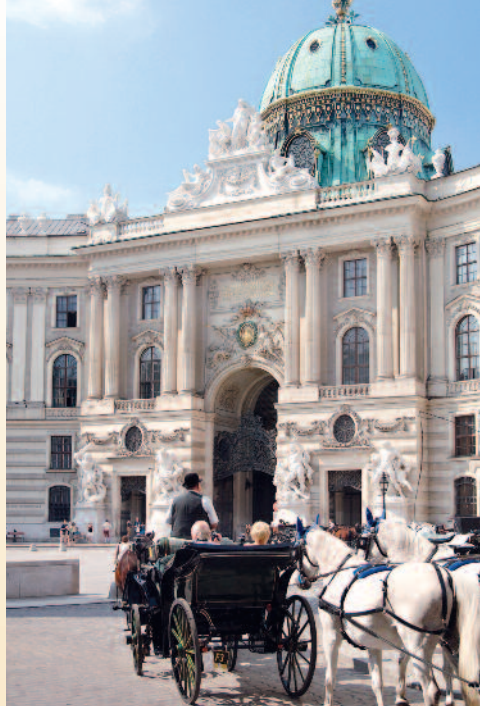
The Imperial Palace, Vienna

BRATISLAVA • An ancient coronation city, Bratislava was the seat of power for the Kingdom of Hungary for more than three centuries in the Middle Ages. Today, it is the capital of Slovakia, a historic region with a charm and character all its own. The compact Old Town is replete with a lively main square, preserved fortifications and austere Gothic buildings. Among them, the pale pink-and-white Primate's Palace was built in 1778 and topped with various marble statues and a large cast-iron cardinal's hat.