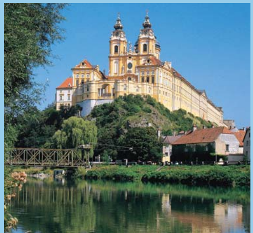
Founded in 1089, the Austrian Benedictine Abbey of Melk houses a world-renowned monastic library.

Disembark the ship and continue on the Budapest Post-Program Option, or transfer to the airport for your return flight to Canada.