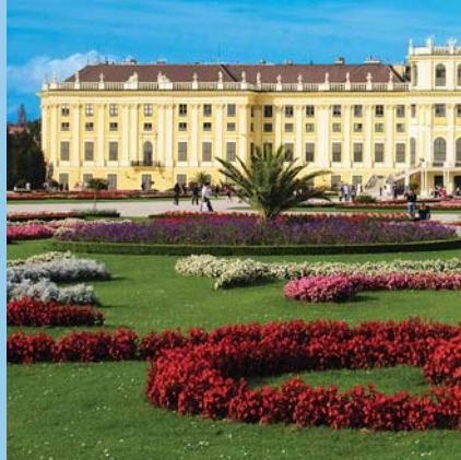
Admire the rococo grandeur of Schönbrunn playground of Habsburg royalty from Marie

See St. Vitus Cathedral; view original Beethoven manuscripts in Lobkowitz Palace in Prague Castle and enjoy a specially arranged, private string quartet concert of the composer's works; then, walk through the "Golden Lane," a street formerly lined with goldsmiths that today is known for its small houses built in the Mannerist style at the end of the 16 th century.