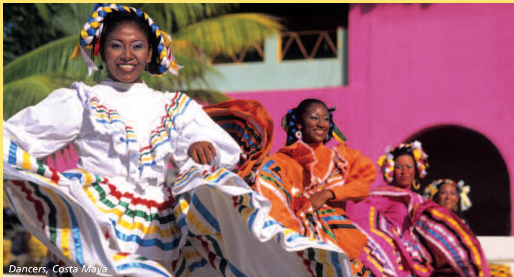
Dancers, Costa Maya