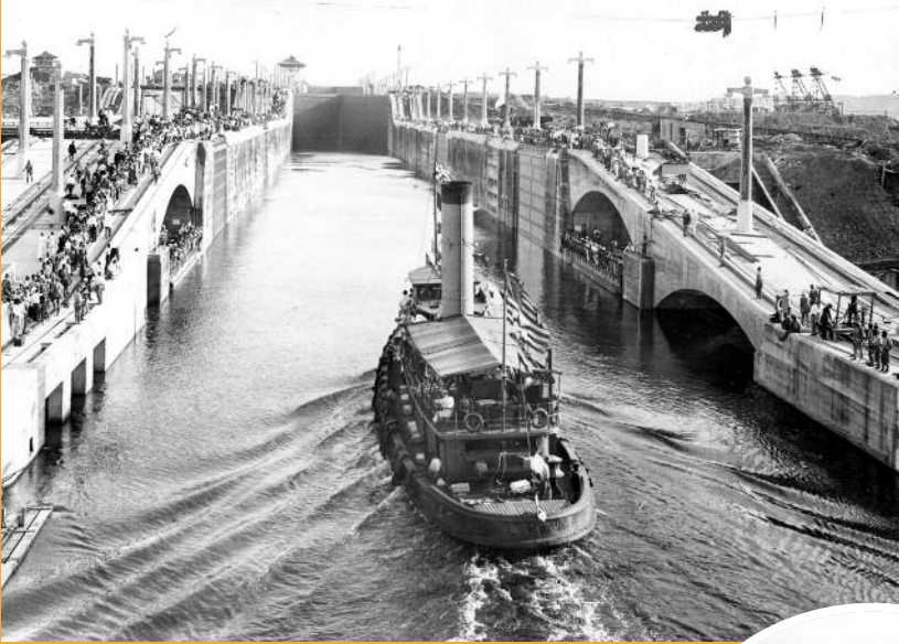
Left: Construction of canal locks, 1913