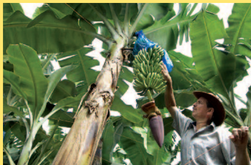
Banana plantation, Puerto Limón

Located on the Caribbean coast of Costa Rica, Limón has been an important hub of Costa Rica since the port was established in 1871. The construction of a railway to San José a few years later turned what was once a migrant fisherman's village into an important centre of commerce. The city was the birthplace of the now international United Fruit Company, and coffee, citrus, bananas and other agricultural products have long been the mainstay of the local economy.