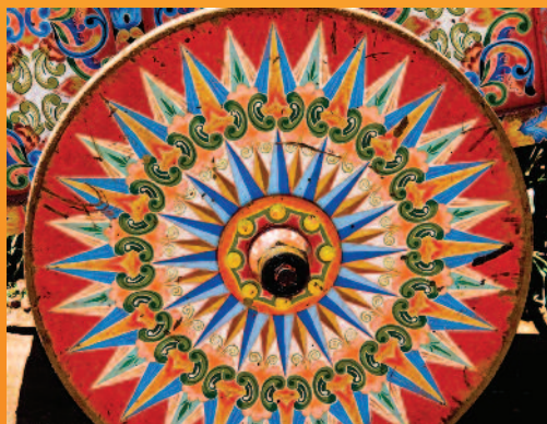
Top: Rain forest near San Jose

† Provided for Air/Sea Program passengers only.