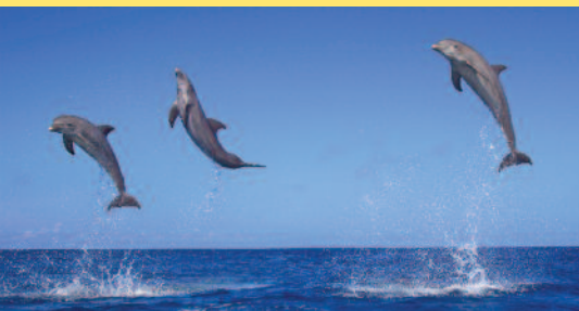
Below: Dolphins, Roatan Island

Belize City unexpectedly offers some striking examples of Victorian architecture. Explore Victorian mansions that have been restored and converted into inns, museums, galleries and restaurants, and see how they mingle with British colonial gems as well as the oldest Anglican cathedral in Central America, St. John's Cathedral, to create an unmatched cityscape. Belize is also a stunning natural landscape thanks to the local efforts to protect Central American wildlife.